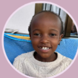
Brightness turned 8 on 6/28