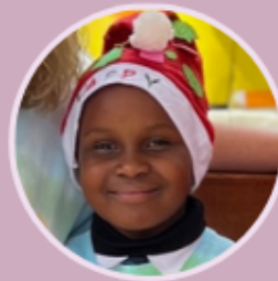
Happyness turned 9 on 6/1