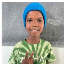
Gracious Turns 7 on 11/15